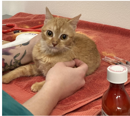
One of the six kittens undergoing an intake exam.

High-risk situations like this continue to remind us of how crucial our work is, the importance of advocating for those who don't have a voice, and the value of our local and regional partnerships. We were thrilled to help these cats and their caretaker in their time of need. Our work with this family is not done, and we will be making another trip to help any remaining cats. Taking on this many animals at one time is costly, but we know that with the incredible generosity from Alliance supporters, we can continue our live-saving work making a difference for animals in need.