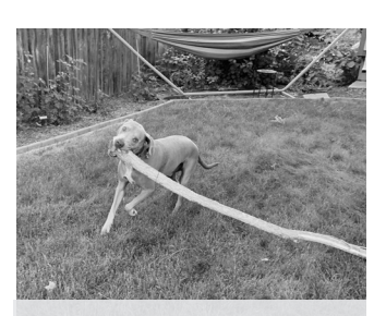
Mack "branching" out after recovering post-surgery